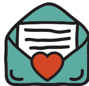
Short letter of comfort