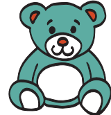
Small cuddly or toy